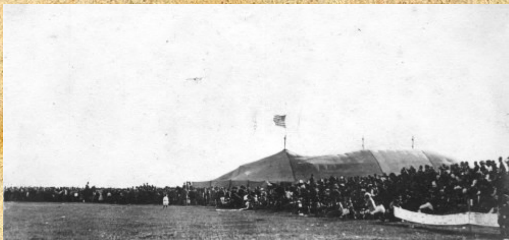
The large tents and grandstands.